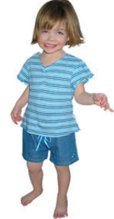
100% Cotton top and bottom