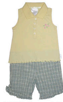
168-YG hopscotch 3-6m 6-12m 12-18m 18-24m