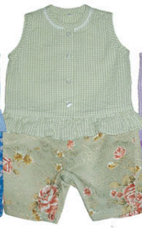
36-39-GR picnic 3-6m 12-18m 18-24m