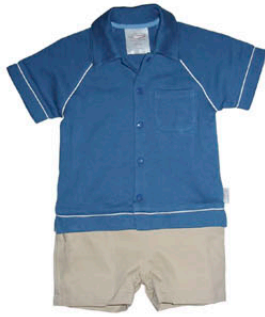
176-BL lucas 3-6m 6-12m 12-18m 18-24m