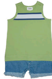
173-GR hoops 3-6m 6-12m 12-18m 18-24m