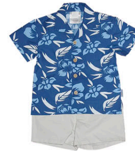
181-NB Oh Wahoo! II 3-6m 6-12m 12-18m 18-24m