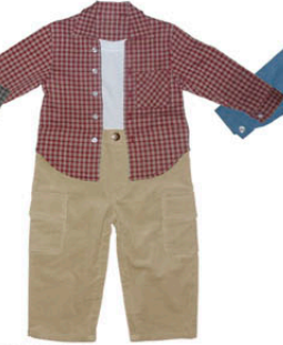
164-RC deer camp 3-6m 6-12m 12-18m 18-24m