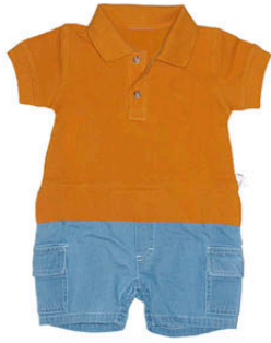
174-OR mully 3-6m 6-12m 12-18m 18-24m