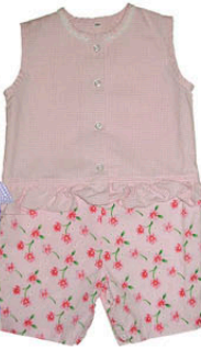
21-24-PK picnic 3-6m 6-12m 12-18m 18-24m