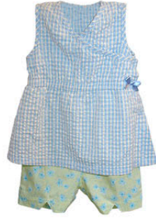
178-BYB cleo 3-6m 6-12m 12-18m 18-24m