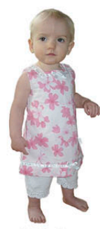
100% Cotton top and bottom