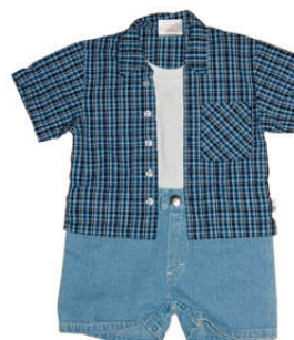
179-BD sling shot 3-6m 6-12m 12-18m 18-24m