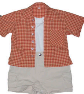
91-94-OC chips & cheese 3-6m 6-12m 12-18m 18-24m