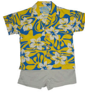
116-119-GR poo poo platter 3-6m 6-12m 12-18m 18-24m