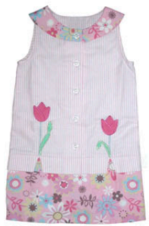
186-PK garden party 3-6m 6-12m 12-18m 18-24m