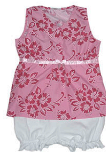
170-PH swing set 3-6m 6-12m 12-18m 18-24m