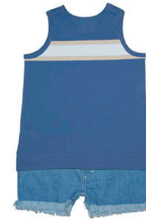
173-BL hoops 3-6m 6-12m 12-18m 18-24m