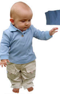
100% Cotton top and bottom