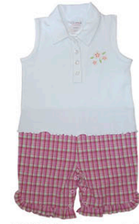
168-WP hopscotch 3-6m 6-12m 12-18m 18-24m