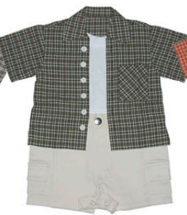
86-89GR chips & cheese 3-6m 6-12m 12-18m 18-24m