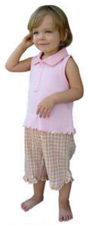
100% Cotton top and bottom