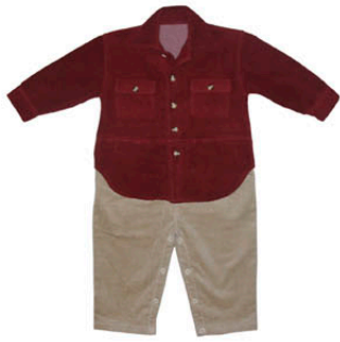
166-MT cider mill 3-6m 6-12m 12-18m 18-24m