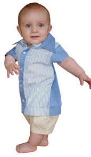
100% Cotton top and bottom