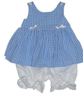
66-69-BC mackinac island 3-6m 6-12m 12-18m 18-24m