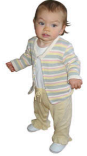
100% Cotton top and bottom