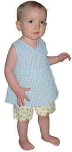
100% Cotton top and bottom