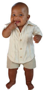
Cotton/Linen blend top and bottom