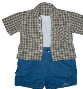
96-99-BC chips & cheese 3-6m 6-12m 12-18m 18-24m