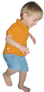
100% Cotton top and bottom