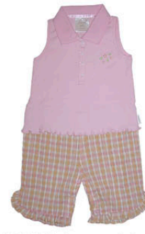
168-PO hopscotch 3-6m 6-12m 12-18m 18-24m