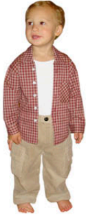
100% Cotton top and bottom