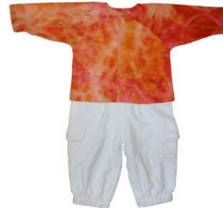
160-OC pumpkin patch 3-6m 6-12m 12-18m 18-24m