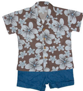
111-114-BF poo poo platter 3-6m 6-12m 12-18m 18-24m