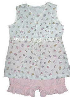
170-WP swing set 3-6m 6-12m 12-18m 18-24m