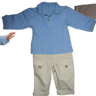
185-BL henley house 3-6m 6-12m 12-18m 18-24m