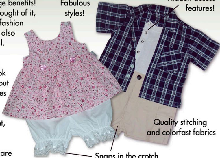
Quality stitching and colorfast fabrics