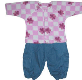
160-PK pumpkin patch 3-6m 6-12m 12-18m 18-24m