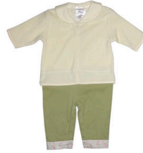
161-GR sweetheart 3-6m 6-12m 12-18m 18-24m