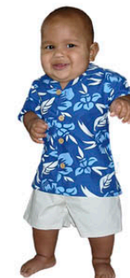
Poly Microfiber top 100% Cotton bottom