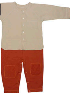
165-OR hay ride 3-6m 6-12m 12-18m 18-24m