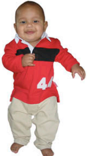
100% Cotton top and bottom