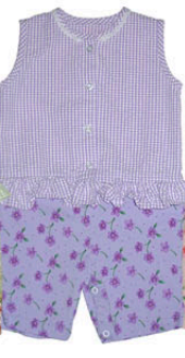
26-29-LV picnic 3-6m 6-12m 12-18m 18-24m