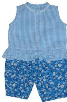
31-34-BL picnic 3-6m 6-12m 12-18m 18-24m