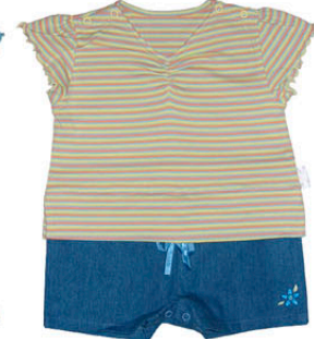
169-YO jump rope 3-6m 6-12m 12-18m 18-24m