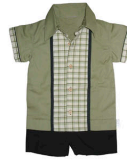
187-GB lounge lizard 3-6m 6-12m 12-18m 18-24m