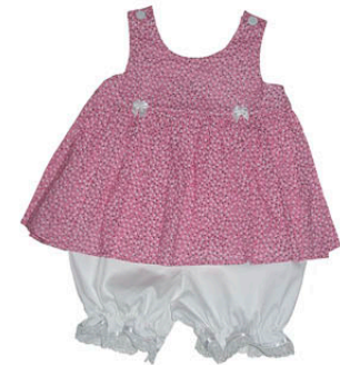
76-79-PK mackinac island 3-6m 6-12m 12-18m 18-24m