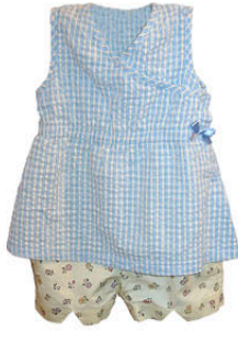
178-BYA cleo 3-6m 6-12m 12-18m 18-24m