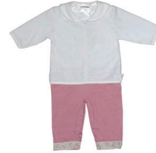
161-PK sweetheart 3-6m 6-12m 12-18m 18-24m