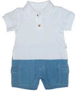
174-WT mully 3-6m 6-12m 12-18m 18-24m