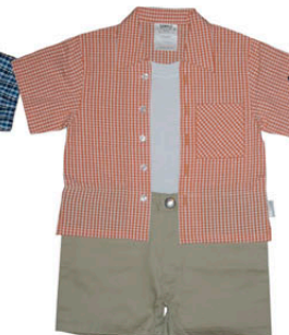
171-OC sling shot 3-6m 6-12m 12-18m 18-24m