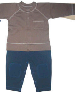
165-BL hay ride 3-6m 6-12m 12-18m 18-24m