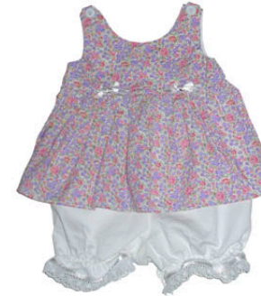
72-74-LV mackinac island 3-6m 12-18m 18-24m