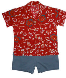
106-109-RD poo poo platter 3-6m 18-24m only