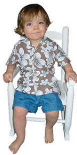
Poly Microfiber top 100% Cotton bottom