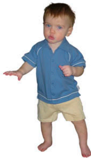
100% Cotton top and bottom