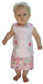
100% Cotton top and bottom