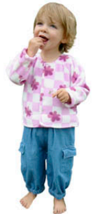
Fleece top 100% Cotton bottom