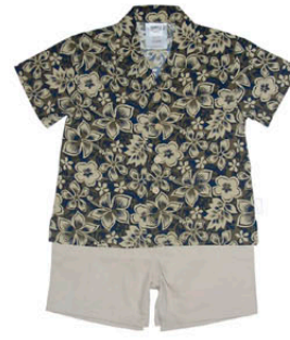
172-BR Oh Wahoo! 3-6m 18-24m only