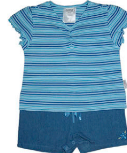
169-BL jump rope 3-6m 6-12m 12-18m 18-24m