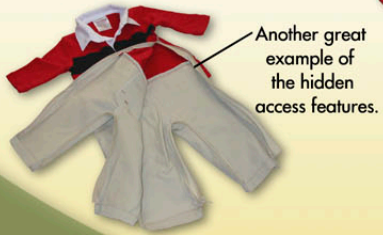
Another great example of the hidden access features.

Stylease is designed with a roomy fit for comfort and longer wear.