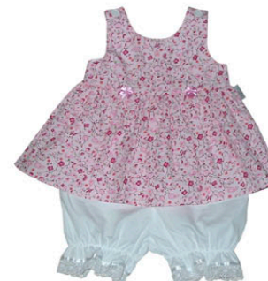
183-PP mackinac island II 3-6m 6-12m 12-18m 18-24m