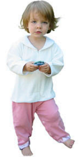
GR - Cotton top and bottom PK - Poly top cotton bottom