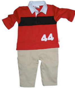
184-RB drop kick 3-6m 6-12m 12-18m 18-24m