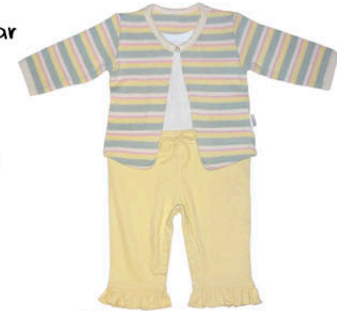
162-GS homecoming 3-6m 6-12m 12-18m 18-24m

Stylease® patented infant wear uses light to medium weight, breathable fabrics so baby doesn't get overheated. The comfortable romper design keeps kids happy and parents love the tidy layered look. Happy kids, happy parents - We LOVE that!