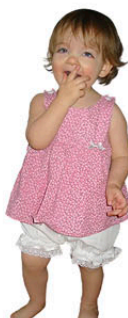
100% Cotton top and bottom