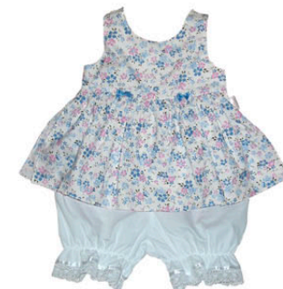
182-BF mackinac island II 3-6m 6-12m 12-18m 18-24m