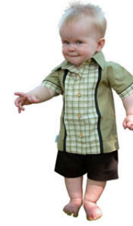
100% Cotton top and bottom