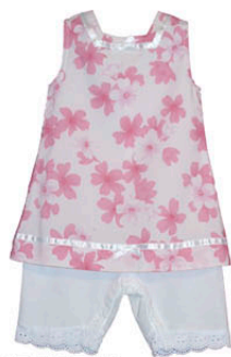
177-PK Lil 3-6m 6-12m 12-18m 18-24m