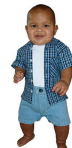
100% Cotton top and bottom