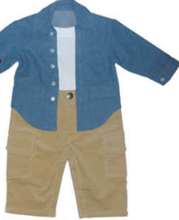
164-DM deer camp 3-6m 6-12m 12-18m 18-24m

Stylease® patented infant wear uses light to medium weight, breathable fabrics so baby doesn't get overheated. The comfortable romper design keeps kids happy and parents love the tidy layered look. Happy kids, happy parents - We LOVE that!