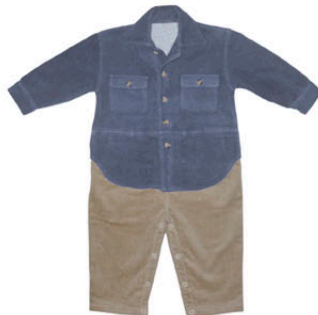
166-BT cider mill 3-6m 6-12m 12-18m 18-24m