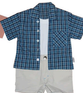
180-BT sling shot 3-6m 6-12m 12-18m 18-24m