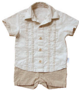
175-NA anthony 3-6m 6-12m 12-18m 18-24m