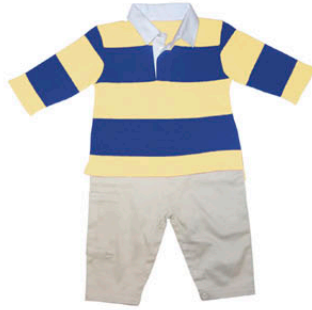
167-BY half time 3-6m 12-18m 18-24m