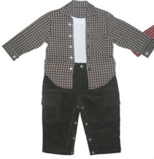
164-BC deer camp 3-6m only