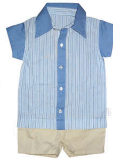
188-BL ivy league 3-6m 6-12m 12-18m 18-24m